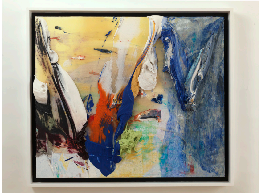
James Walsh, Two Flying Vee's , 2010, 28 x 33 inches, acrylic on canvas

Modernist abstract painting typically relied upon the apprehension of color on a large scale, and invites viewing from a distance. My paintings move in somewhat the opposite direction: they concentrate inwards and demand close inspection.