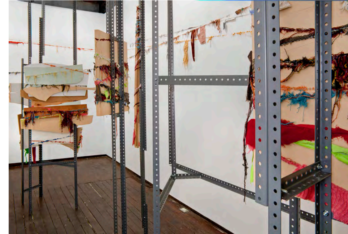
Into the Fray 2011 Installation view at Lmak Projects, New York, New York Wood, laminates, fiberboard, metal staples, textile, hardware Dimensions variable