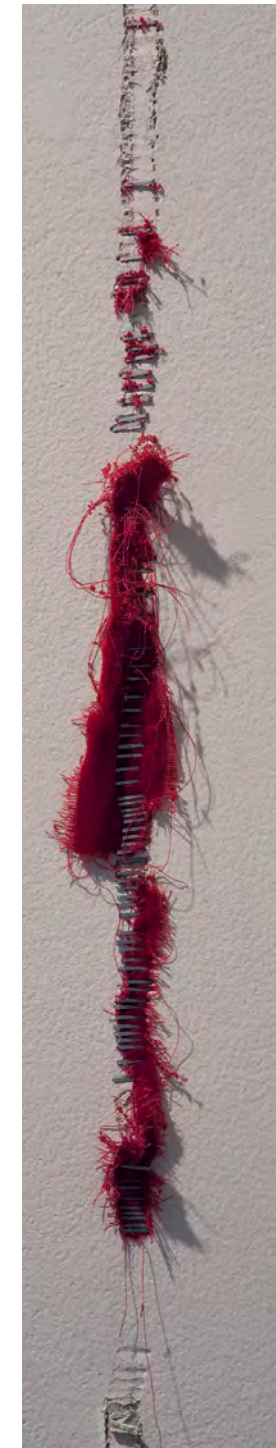
Untitled (Seams) 2009 Detail Installation at the Daum Museum, Sedalia, Missouri