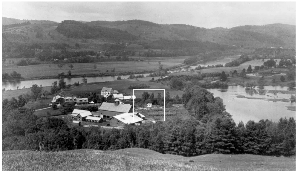
The playhouse in the meadow viewed from Dingleton Hill, 1891