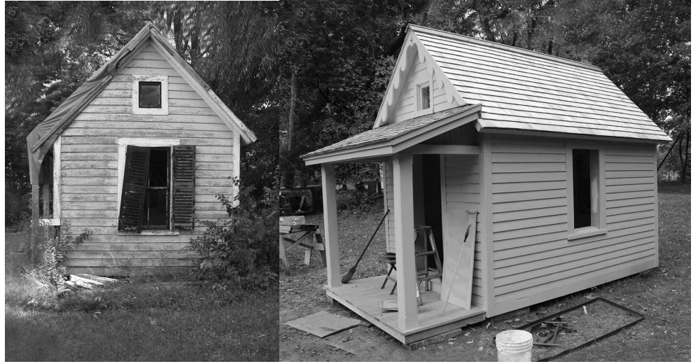
The playhouse at Blow-Me-down Farm before (left) and after (right) restoration over the summer of 2012.