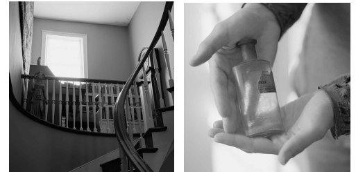
(Top) View from Aspet looking west toward Mount Ascutney. (Left) Interior of Aspet looking up the stairs. (Right) One of Saint-Gaudens' medicine bottles.