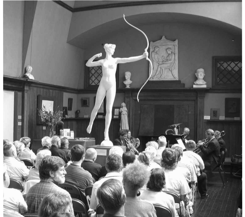
(Above) The Little Studio, 1920. (Right) The Little Studio, 2006.