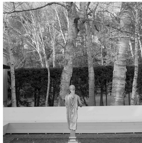
View of Pan , a copy of an ancient Pompeiian sculpture, in the gardens of Aspet.

I had never been to Aspet before receiving this award and brought to my first visit a preconceived notion of what I would find. I imagined walking into Saint-Gaudens' home and immediately feeling his presence. But upon entering the house I realized that, as stunning as it was, it was no longer a lived-in space in the sense that I was accustomed to. Instead, it was a type of public/private space that would require an approach different from the one that I would normally take when photographing someone's home. It felt more like what it is —