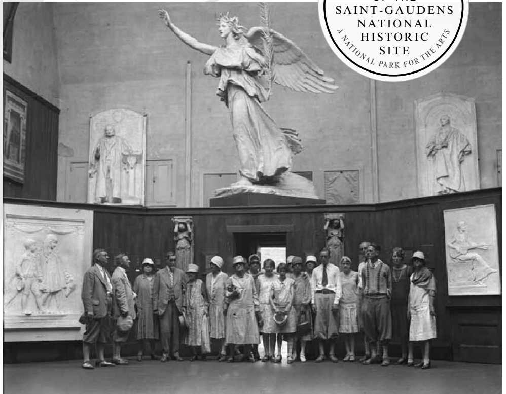
Studio of the Caryatids, circa 1927. The Studio was lost in a fire in 1944.