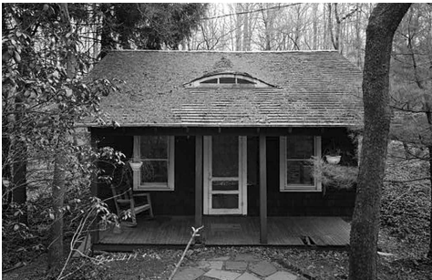
The Ravine Studio.