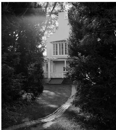
The east side of Aspet seen through the hedges.

When I received word that I was the recipient of a fellowship from the Saint-Gaudens Memorial, I was overjoyed. It seemed like a perfect fit for a photographer of interior spaces — an imposing property bathed in river light and situated on a small rise overlooking Mt. Ascutney.