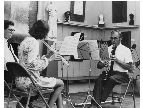
1971 concert in the Little Studio.

The National Park Service is charged with the ongoing maintenance and management of the property; exhibition, conservation and loan of items in the collection; and interpretation and public education relating to the period, the artist and his works, among other things, for its 38,000 annual visitors. The Trustees of the Memorial continue to initiate, sponsor and fund music, exhibition and Fellowship programs and to support conservation and educational programs run by the park.