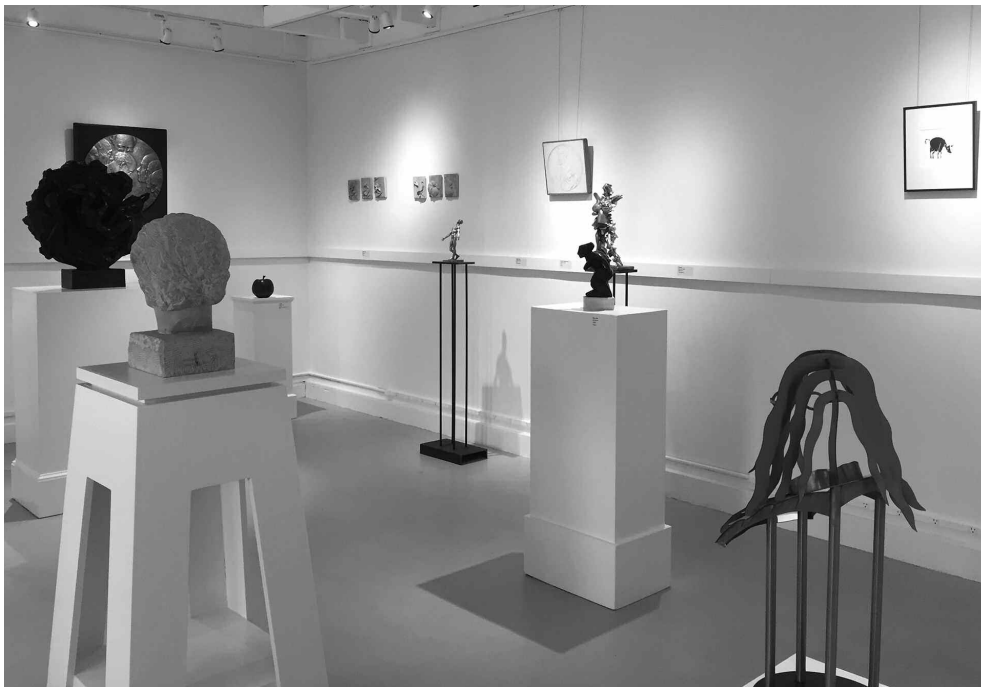
Views of the exhibition "When I was Here...Remembering Our Artists-in-Residence."