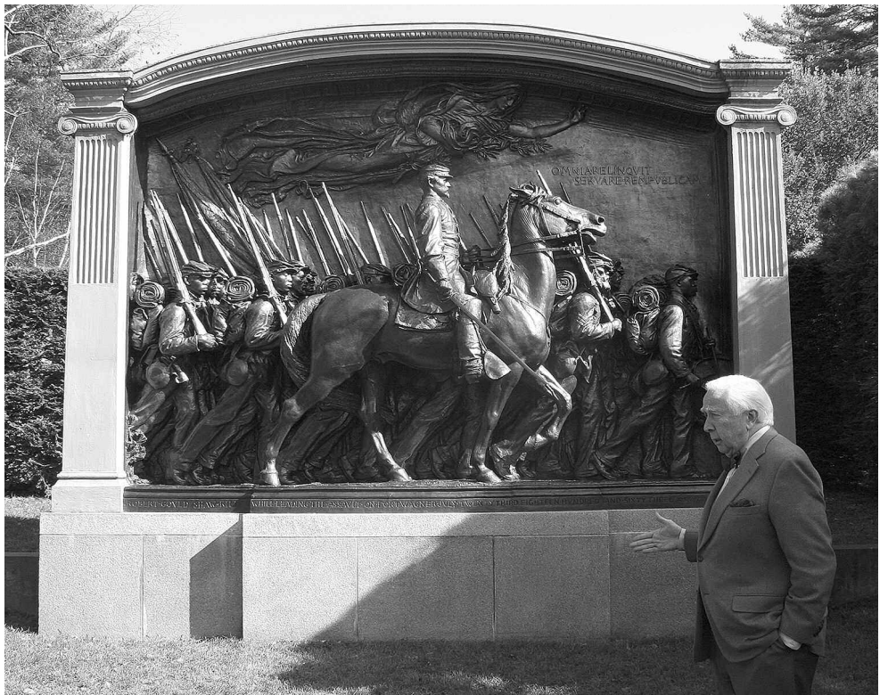
Author David McCullough giving a talk in front of the Shaw Memorial in 2013.